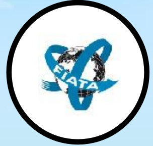
Individual member of FIATA (International Federation of Freight Forwarders Associations)