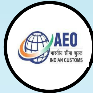
Approved by Indian Customs as Authorized Economic Operator. (AEO)