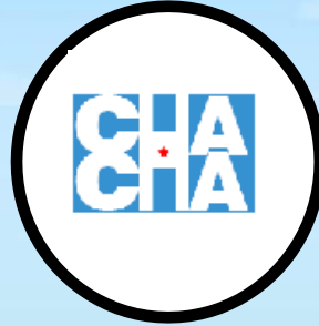
Member of Custom House Agents